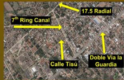
The project is located in Barrio Telchi, within District 10 of Santa Cruz, Bolivia.